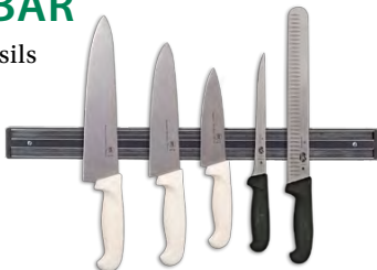
Knives sold separately