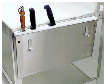
Knives and steels sold separately