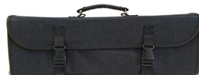
CP10 Knife Roll, Black Polyester BCK2 ..... Butcher's Kit