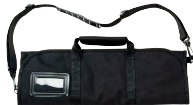
44956 Knife Roll, Black Polyester 46152 ..... Culinary Kit