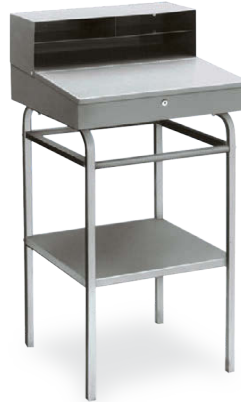
Dimensions: 24" w x 22" d x 45" h MDS2253..... Receiving Desk

Sloped writing surface lifts up and serves as a lockable storage compartment.