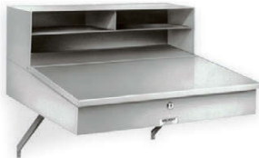
Dimensions: 24" w x 22" d x 12" h MD2253..... Wall Type Receiving Desk

Sloped writing surface lifts up and serves as a lockable storage compartment.