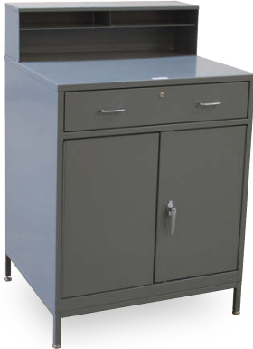
MD2251..... Cabinet Receiving Desk

Features lockable storage drawer and double door cabinet entry with lock. Dimensions: 34½" w x 30" d x 53" h