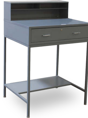
MD2250..... Receiving Desk

Lockable storage drawer. Dimensions: 34½" w x 30" d x 50" h