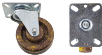
WH7322 .....Swivel Plate Caster