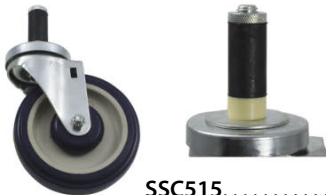
SSC515 ..... Swivel Caster Round Stem