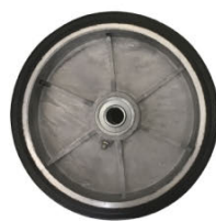
WH712 ..... Wheel Only for Utility Carts