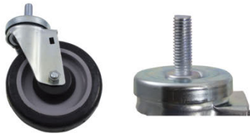
TSC515 .....Swivel Caster with Threaded Stem