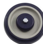
RW82 ..... Wheel Only for Utility Carts