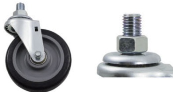
TSC51534 .....Swivel Caster with Threaded Stem