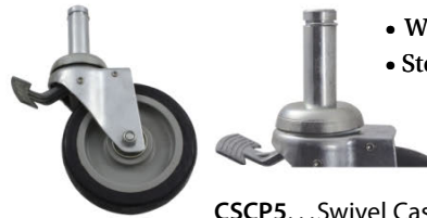
CSCP5 ...Swivel Caster with Brake Grip Ring Stem