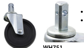
WH751 .....Swivel Caster with Square Stem