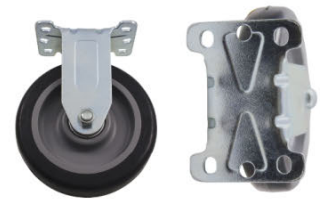
RPC515 ..... Rigid Plate Caster