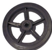
HTW82 ..... Wheel Only for Hand Trucks