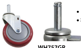
WH757GR ..... Swivel Caster Grip Ring Stem