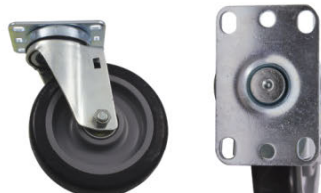
PSC515 .....Swivel Plate Caster