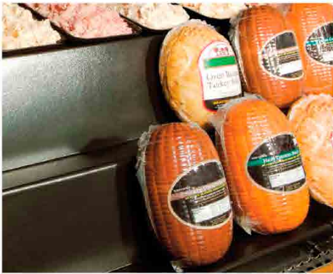
THREE STEP ZIG ZAG RISER