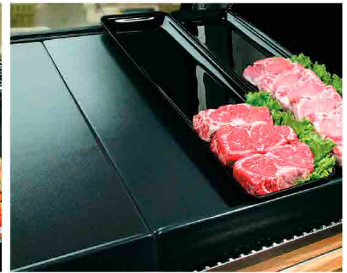
BULK FOOD RISERS RISER WITH TIERED BACK