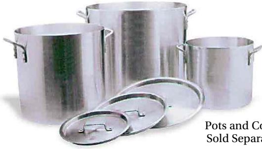
Pots and Covers Sold Separately

Heavy duty, constructed of standard gauge brushed aluminum.