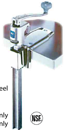
S11 ..... Can Opener, Stainless Steel

Sanitary cast stainless steel won't corrode and will provide years of reliability. Features a new quick change gear mechanism and "pull pin" for easy blade replacement, stainless knife and gear. Opens most sizes and shapes up to 14" tall. Screw down base.