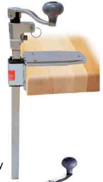
G2CO ..... Can Opener, Light Duty