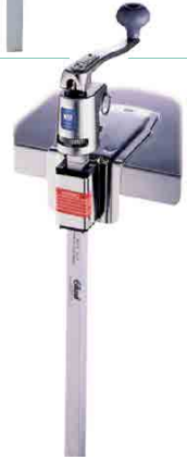
U12L ..... Can Opener with Long Bar