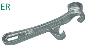
PO1 ..... Junior Pail Opener