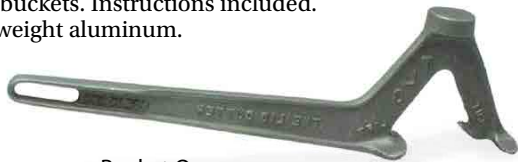
PBO20 ..... Bucket Opener

Removes and reseals lids from 4, 5 and 6 gallon plastic buckets safely, quickly and easily. Bucket opener operates by simply pushing down on handle. Full 15½" long for extra leverage on tightly sealed buckets. Instructions included. Made of lightweight aluminum.