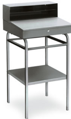
Dimensions: 24" w x 22" d x 45" h MDS2253..... Receiving Desk

Sloped writing surface lifts up and serves as a lockable storage compartment.