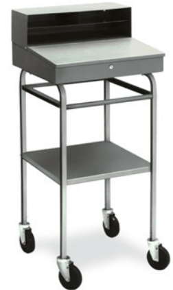
Dimensions: 24" w x 22" d x 45" h MPD2253..... Mobile Receiving Desk

Sloped writing surface lifts up and serves as a lockable storage compartment. Rolls easily on four 5" heavy-duty swivel stem casters.