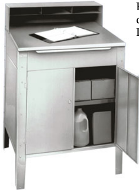
MD2251..... Cabinet Receiving Desk

Features lockable storage drawer and double door cabinet entry with lock. Dimensions: 34½" w x 30" d x 53" h