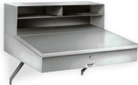
Dimensions: 24" w x 22" d x 12" h MD2253..... Wall Type Receiving Desk

Sloped writing surface lifts up and serves as a lockable storage compartment.