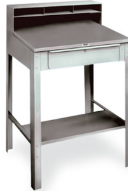
MD2250..... Receiving Desk

Lockable storage drawer. Dimensions: 34½" w x 30" d x 50" h