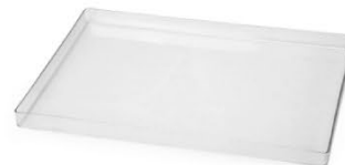
WVL171204TG Rectangular Liner (Clear PETG) 16.25" x 11.75" x 1"