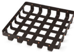
WVB12PC10 Square Basket (Black) 12.5" x 12.5" x 2"