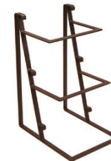
WRK1019PC65 3 Tiered Stand (Rust) 10" x 13.25" x 18.6"