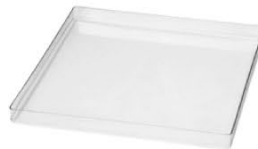
WVL1204TG Square Liner (Clear PETG) 11.75" x 11.75" x 1"