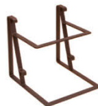
WRK1011PC65 2 Tiered Stand (Rust) 10" x 11" x 10.6"