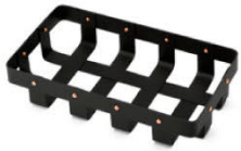
WVB106PC10 Rectangular Basket (Black) 10.25" x 5.75" x 2"