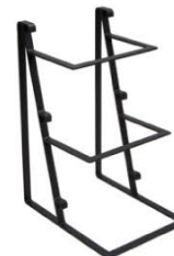
WRK1019PC10 3 Tiered Stand (Black) 10" x 13.25" x 18.6"