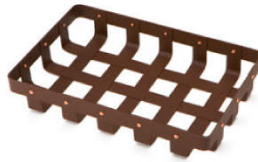
WVB128PC65 Rectangular Basket (Rust) 12.5" x 8" x 2"