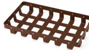
WVB158PC65 Rectangular Basket (Rust) 14.75" x 8" x 2"