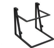
WRK1011PC10 2 Tiered Stand (Black) 10" x 11" x 10.6"