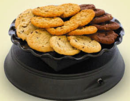
Cakes & Pastries**