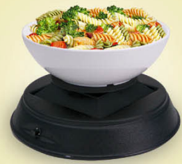
Deli & Meat Specials**